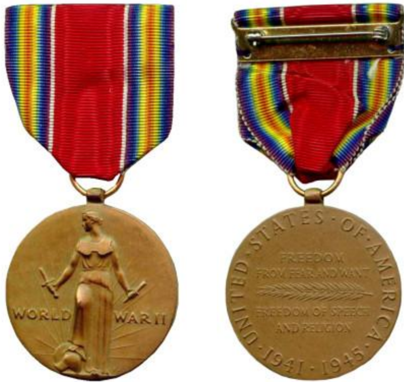
World War Two Medal