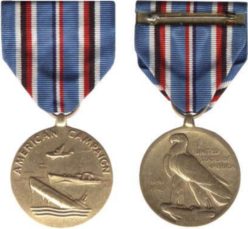
American Campaign Medal