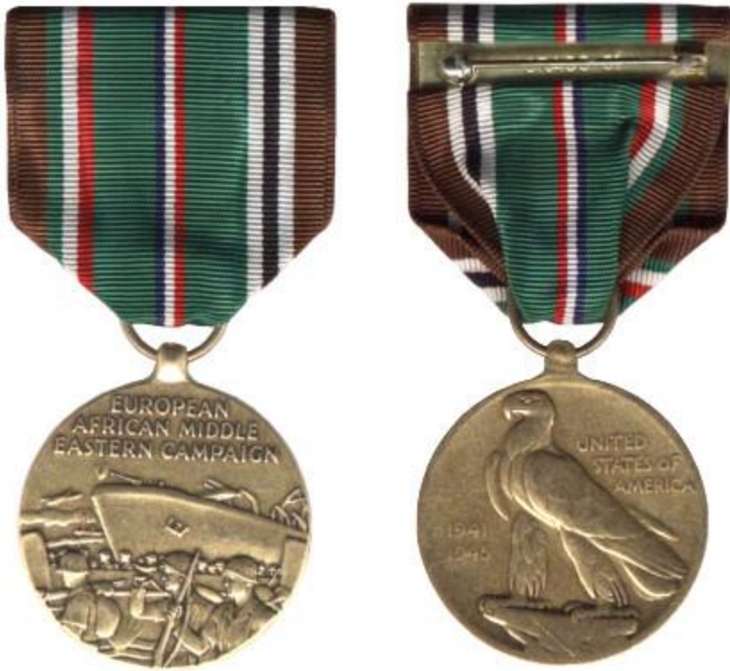
European-African, Middle Eastern Campaign Medal