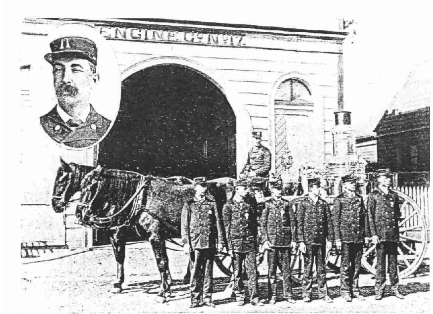
ENGINE Co. No. 17.