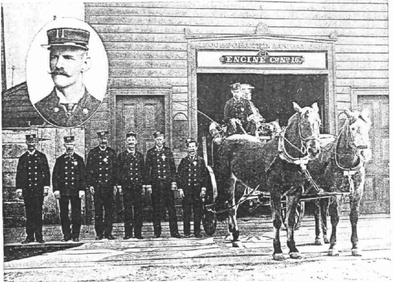
ENGINE Co. No. 16.